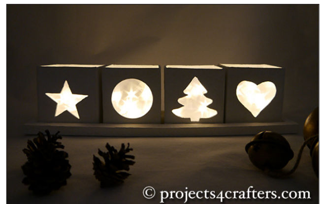
Nite lite holders with LED bud battery operated light strings.