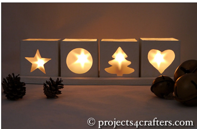
Nite lite holders with glass holders and night light candles.

5 Cut out 8 squares of Starshine to cover the openings. Use double-sided tape on the glossy side to stick the starshine to the inside of the night light holders.